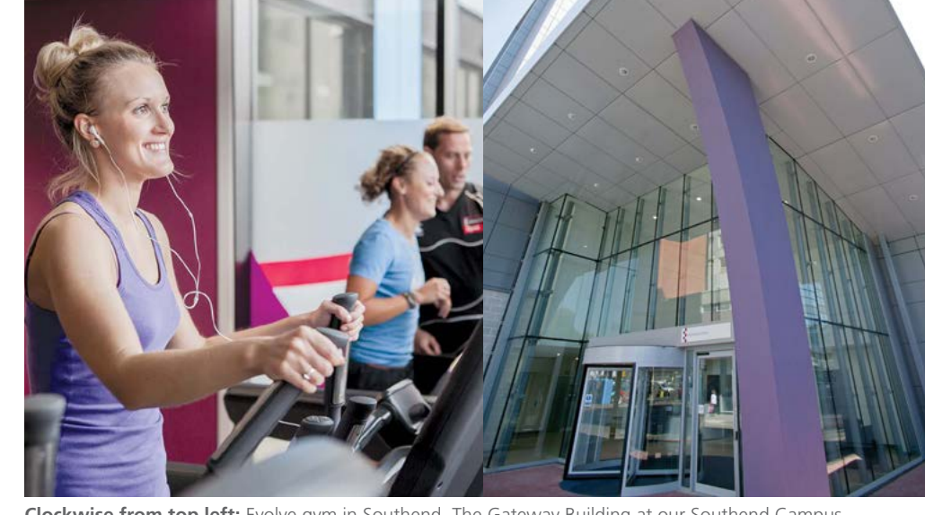
Clockwise from top left: Evolve gym in Southend, The Gateway Building at our Southend Campus and the Ivor Crewe Lecture Hall at our Colchester Campus.